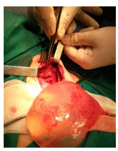
Fig. 2 – Intraoperative finding of big parathyroid cyst in the second case.